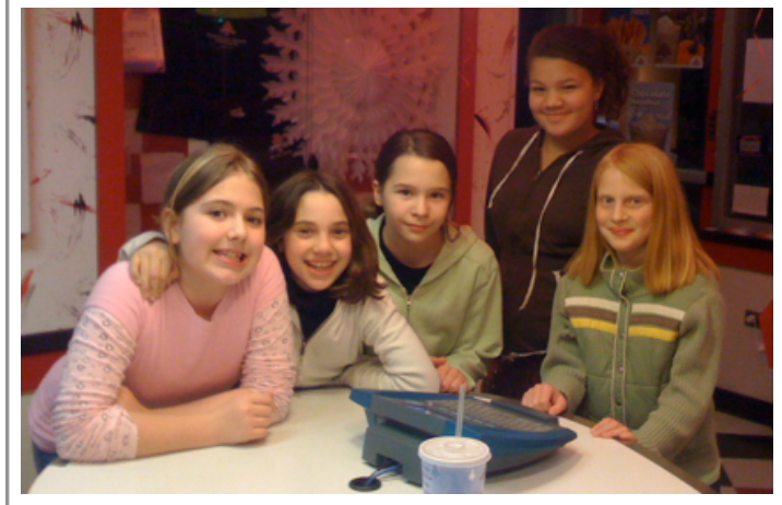
Lewis Night Out at Burgerville....

We had a great turnout for our Lewis Family Night at Burgerville. Thanks to all those that took part and to our PTA for making the event possible.